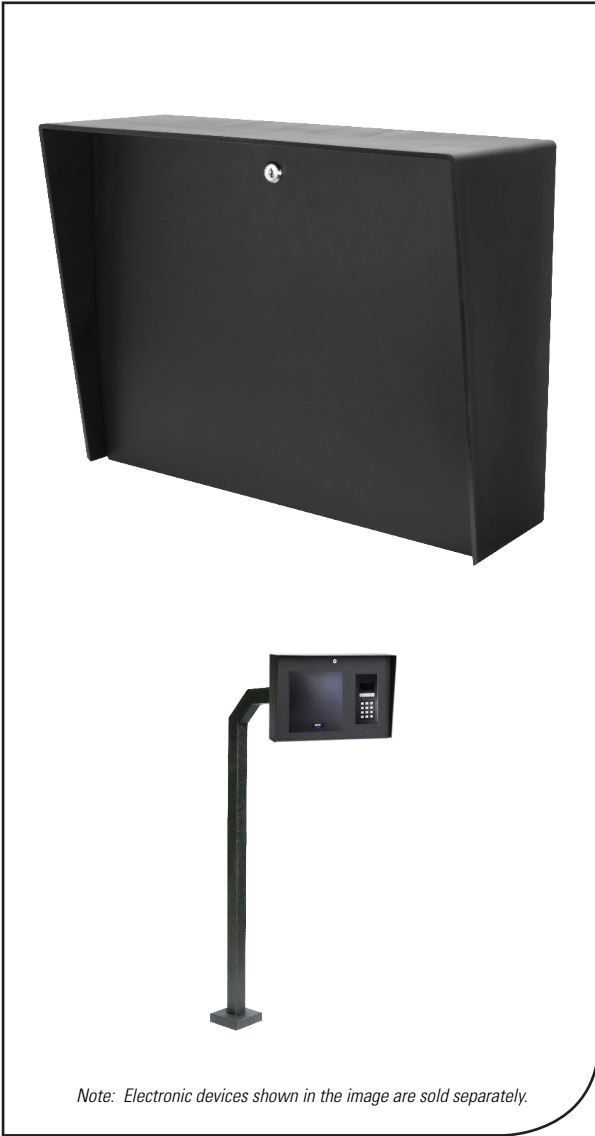
Note: Electronic devices shown in the image are sold separately.